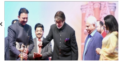
Launch of 'Ramesh Sippy Academy of Cinema and Entertainment'... more