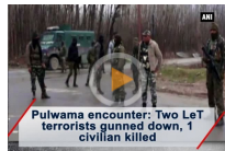
Pulwama encounter: Two LeT terrorists gunned down, 1 civilian killed