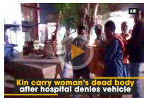
Bihar: Kin carry woman's dead body after hospital denies vehicle