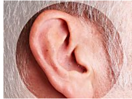
Help your father hear again with the new Siemens hearing aids hear.com