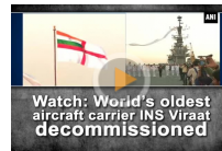
World's oldest aircraft carrier INS Viraat decommissioned