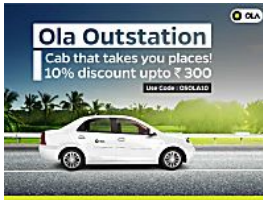
Planning For Outstation Trip? Go on, hop on an Ola Outstation and travel away! blog.olacabs.com