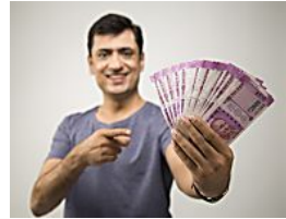
3 Term Insurance myths to get rid off! Max Life Insurance