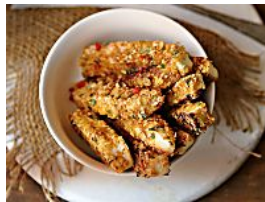
Tasty Paneer for your Palate Saffola Fit Foodie