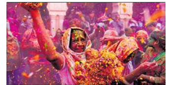
Splash of colours for widows...

Around 1,000 widows from Varanasi and Vrindavan on Thursday splashed colours on each other and actively took part in Holi celebrations especially organised for them at the 400-year-old Gopinath temple in Vrindavan.