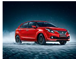
Baleno RS sets your heart racing with its powerful performance and road... The Nexa Experience