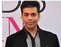
After Tusshar Kapoor, Karan Johar Dares To Be A Single Dad Via Surrogacy LiveInStyle.com