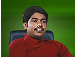
Surprise your wife with extra income of Rs.17000 every week! RummyCircle